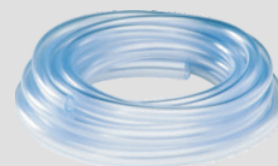
Wrinkle free tube